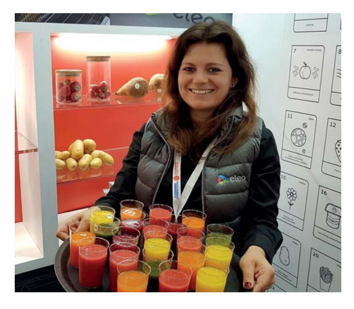
Elea will present its latest range of PEF Advantage systems at Anuga FoodTec. Try product samples and see a demo unit in action. Make sure to visit booth No. B-o69 in hall 10.1 to discuss product and process benefits and what PEF can do for your product.

Pulsed Electric Field (PEF) is a continuous process that inactivates microorganisms at low temperatures. The technique is based on electroporation, a non-thermal effect creating pores in cell membranes. With its low energy and time requirements, PEF is the ideal processing solution for premium quality fruit and vegetable juices and smoothies.