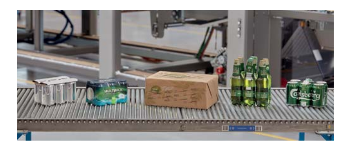
In addition to its modern filling technology and various digital solutions the KHS Group will be exhibiting its entire range of future-proof packaging systems in Cologne.

As part of its Basic Line Monitoring process KHS has developed new standard interfaces for line monitoring and order control. The respective modules facilitate communication between KHS machines and beverage producers' IT