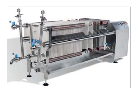
Plate and frame filtration systems are a proven means of removing Alicyclobacillus acidoterrestris bacteria and its spores that cause product spoilage in fruit juice production. Using the BECO COMPACT PLATE A600 filtration system, a large juice concentrate manufacturer was also able to tackle leaks: a significant problem with multi-sheet filters. Thanks to its high pressure tightening and automatic re-tightening, the filtration system not only reduces drip loss to a minimum, it also increases the efficiency and cost-effectiveness of the entire process ...